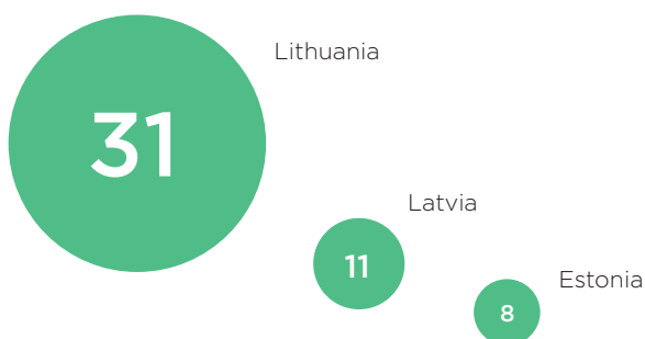
GRAPH 1: Coface Baltic Top 50 - Number of companies per country in 2013